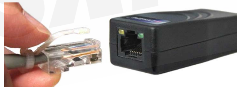
EIA/TIA T-568B Wiring Specifications