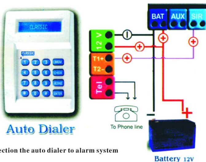
Connection the auto dialer to alarm system